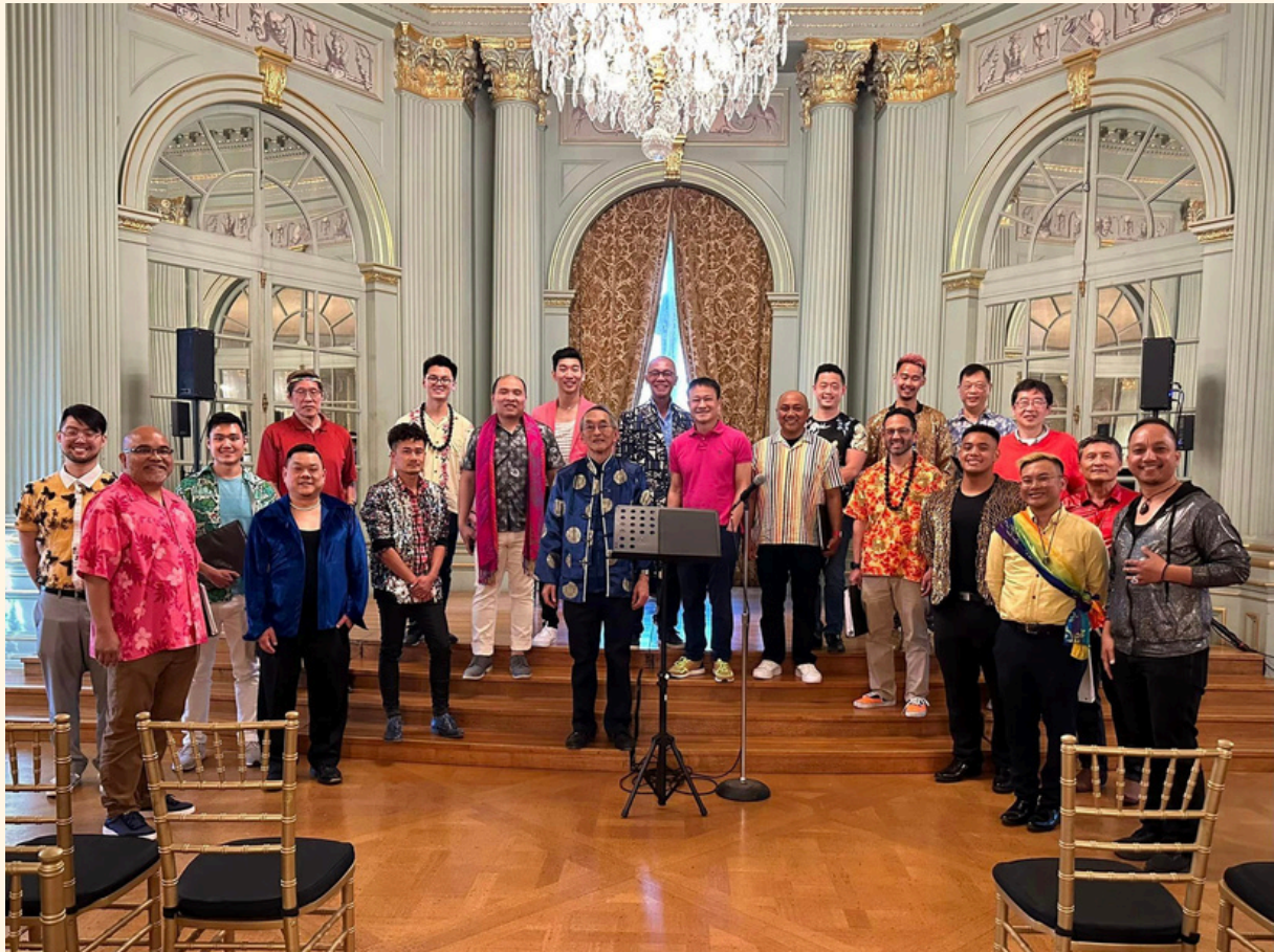
GAPA Men's Chorus at the historic Filoli Estate in Woodside, 2023

We envision a world where queer and transgender Asian and Pacific Islander communities are seen, heard, and celebrated.